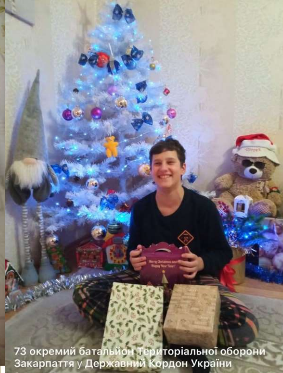
73 окремі батальйон Територіальної оборони Закарпаття у Державний Кордон України